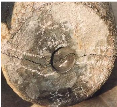
Figure 6. Thermal stress caused this crack extending across the bottom of the crucible.

In all cases, preheating should be done gradually in its early stages to prevent thermal shock damage to the crucible.