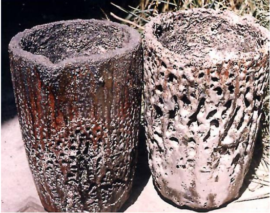
Figure 8. Overfilling caused flux to chemically attack the exterior of these crucibles.