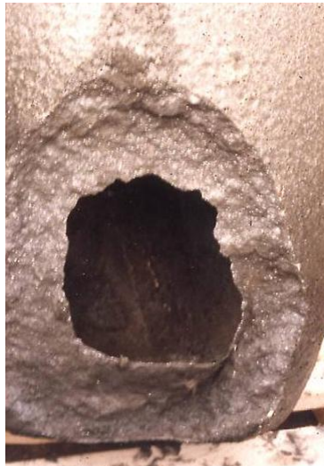
Figure 7. The impact of charge material dropped into the crucible produced this damage.