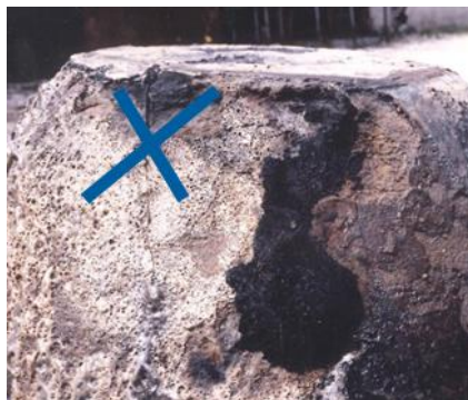
Figure 4. Flame directed to one spot on a crucible produced this damage.