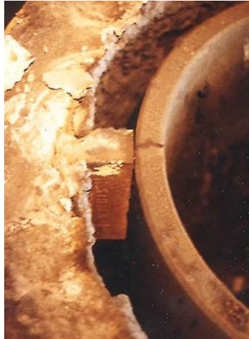
Figure 3. Gripping blocks located too close to the top of the crucible produced a vertical crack.