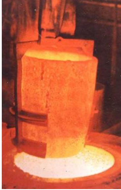
Figure 5. Lifting shanks must be properly sized for your crucible and must provide adequate support.