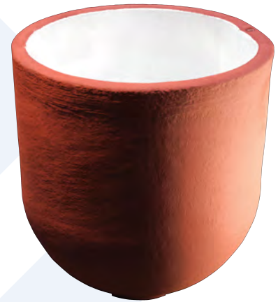
Fig. 1: STAR coated crucible