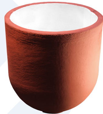
Fig.1: PRO coated crucible