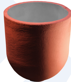
Fig.1: ResCoat coated crucible