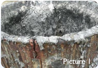
Picture 1 Existing Crucible after 42 days.

As a result of a product change, the crucible was difficult to clean. At the end of the crucible's lifetime, the dross on the crucible wall was more than 50mm. This led to a reduction of capacity and a decreased thermal conductivity. After 42 days, the crucible was changed due to expansion cracks caused by dross.