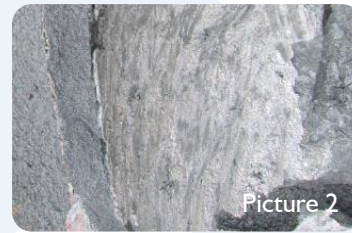
Picture 2 TPS 587 TopAl STAR Coating after 154 days.

In the case of the TopAl STAR crucible, a maximum dross adhesion of around 5 mm was measured at the end of its lifetime. The TopAl STAR crucible was removed after 154 days due to preventive maintenance without any decrease of thermal conductivity, which is related to the oxidation level of the crucible material and the dross adhesion on the crucible inner wall.