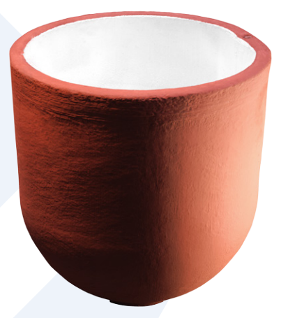
Fig. I: PureCoat coated crucible