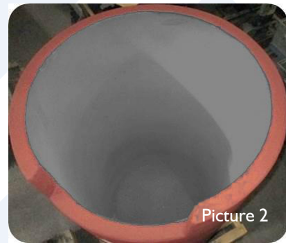
Picture 2 Syncarb with ResCoat Coating.

With ResCoat, the customer achieved 20% higher metal output over the crucible life. This was due to better erosion resistance provided by ResCoat which led to higher crucible life.