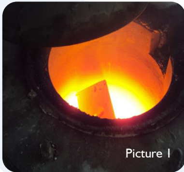
Picture 1 SnPbZn copper alloy melting.

The customer was using an ISO pressed, clay bonded, cylindrical crucible for melting a Copper alloy in an induction furnace at 180 Hz. The low frequency operation created significant metal movement during melting which was wearing off the crucible faster and led to failure of the crucible by erosion.