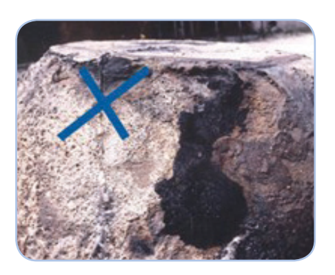
Figure 4. Flame directed to one spot on a crucible produced this damage.

8. In gas or oil fired furnaces, ensure that the furnace flame travels in a tangential pattern around the crucible and does not overheat one spot on its surface. Even heating is essential to achieving a long service life.