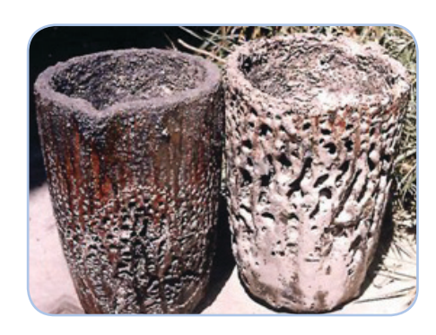
Figure 8. Overfilling caused flux to chemically attack the exterior of these crucibles.

• Protecting Your Crucible From Chemical Attack — If your melting or holding application requires the heavy use of fluxes or produces large amounts of slag or dross, you must use a crucible type that provides resistance to chemical attack and erosion. But you can help any crucible type resist chemical attack and slag and dross accumulation by using the minimum quantity of flux required and only adding flux after the metal is fully molten. It is also important to carefully clean your crucible every day while it is still in a red hot condition. Dross has a high expansion rate and causes internal pressure that can damage the crucible. It also accelerates chemical attack.