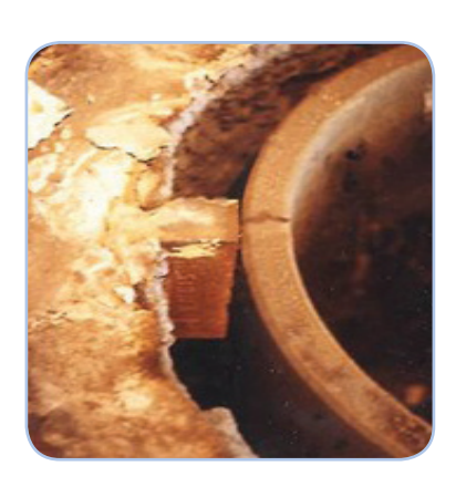
Figure 3. Gripping blocks located too close to the top of the crucible produced a vertical crack.

8. In gas or oil fired furnaces, ensure that the furnace flame travels in a tangential pattern around the crucible and does not overheat one spot on its surface. Even heating is essential to achieving a long service life.