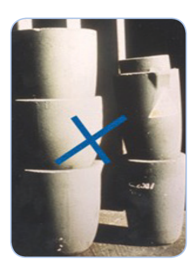
Figure 1. Improper stacking will damage crucibles.