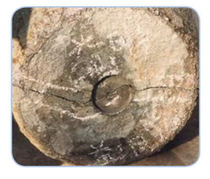
Figure 6. Thermal stress caused this crack extending across the bottom of the crucible.

In all cases, preheating should be done gradually in its early stages to prevent thermal shock damage to the crucible.