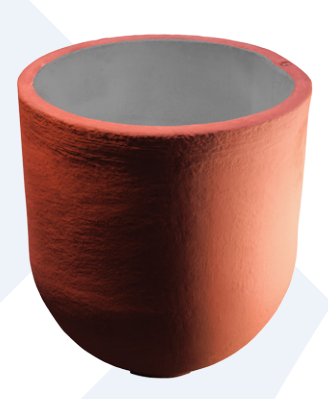
Fig. 1: ResCoat coated crucible