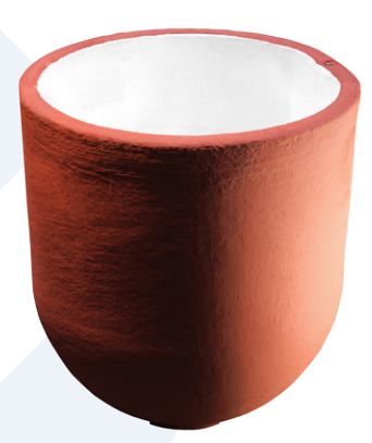
Fig. 1: STAR coated crucible