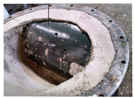
Clay Graphite segment in position in converter